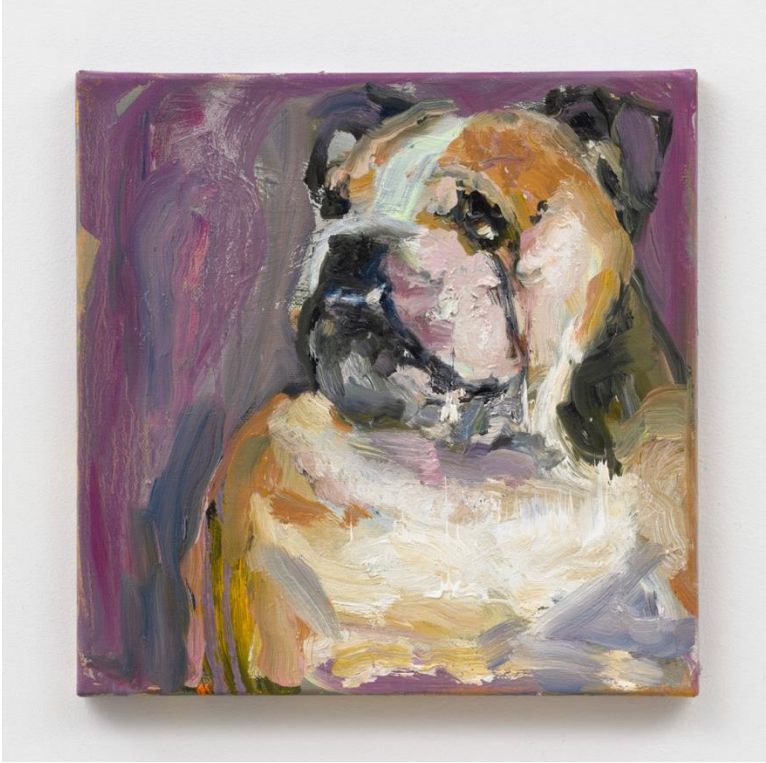
Impasto in Purple Square, 12x12 inches, oil on canvas, 2020