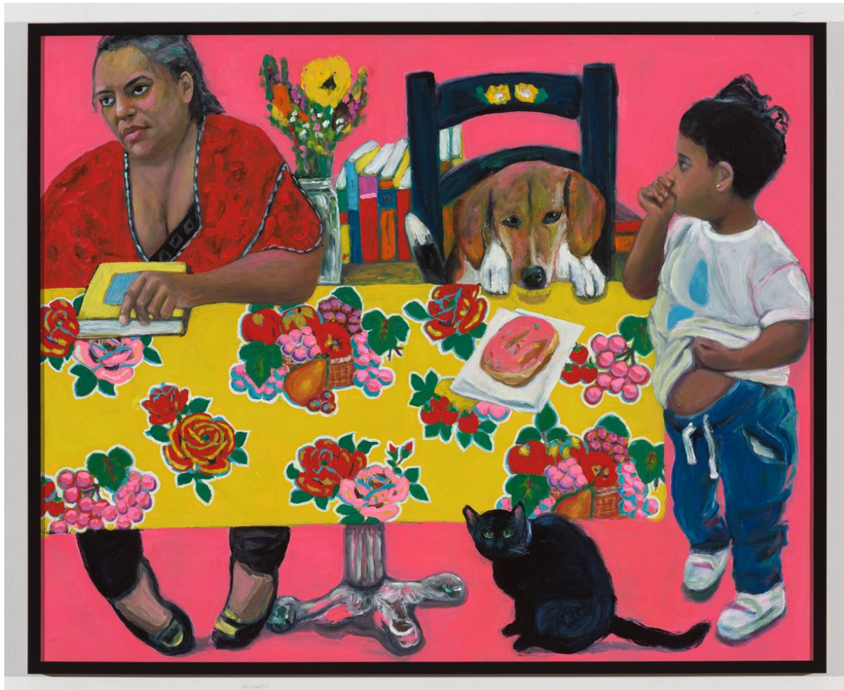
Pink Donut on Pink, Oil on canvas, 2020. 42x52 inches, with frame