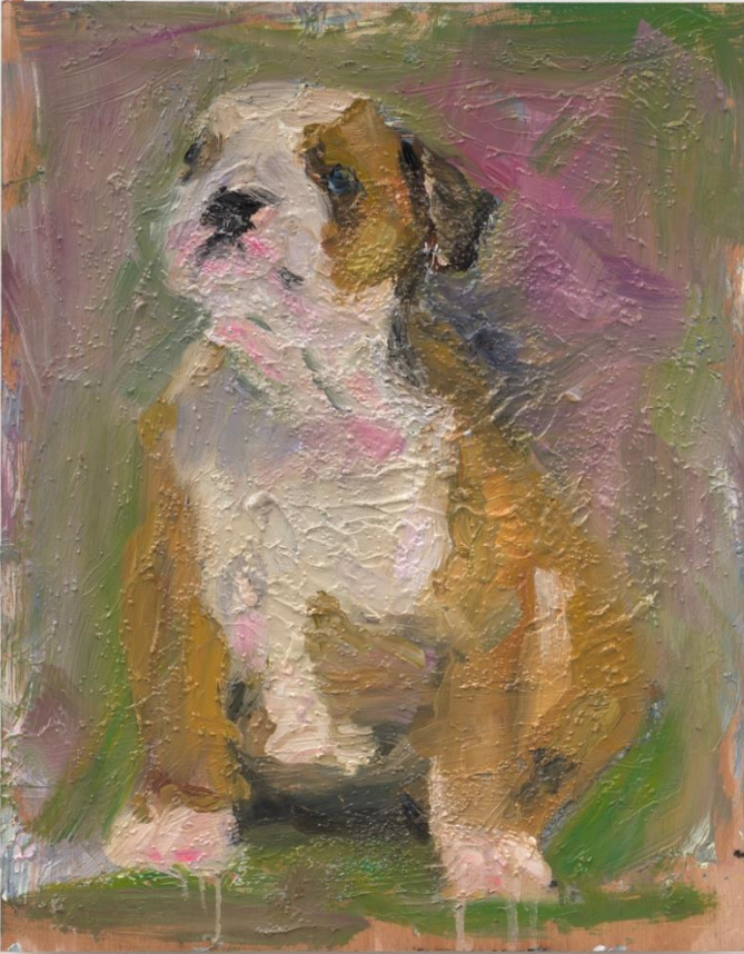
Orange on Texture, 16x20 inches, oil on board, 2020