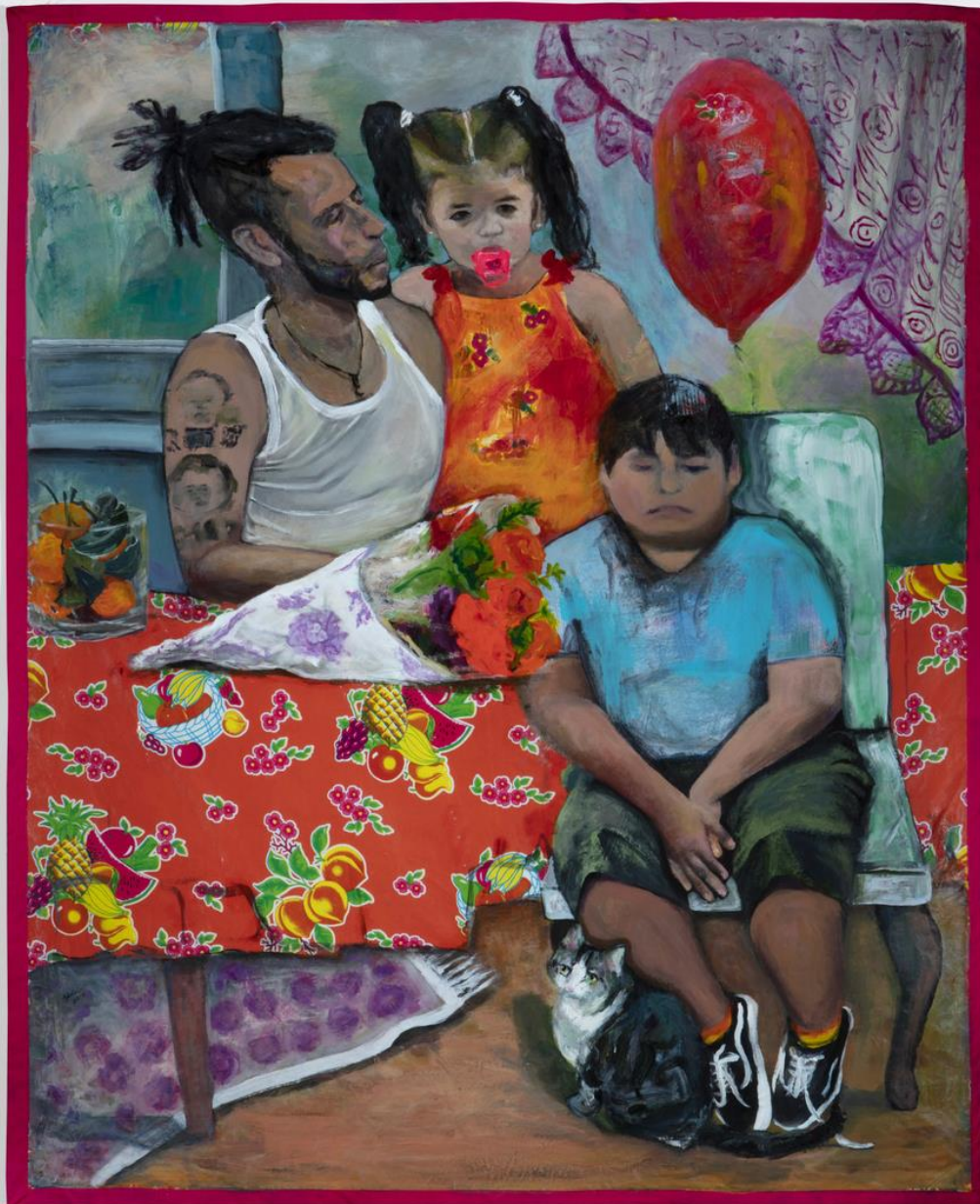
Orange Tablecloth, Acrylic on a Tablecloth, 84x53 inches, 2019

In "Orange Tablecloth", the importance of Mexican homelife and family are explored from the patriarchal side as a father figure sits at a table with his daughter nestled at his side, their arms around each other. Flowers and a balloon suggest a party. The orange, yellow and red tones and pattern of the tablecloth recur in the girl's dress, flowers on the table, balloon and the pop of bright pink in the pacifier.